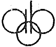
EXHIBIT A auby, oglesby & bartolomucci

consulting engineers land surveyors - planners