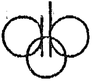
EXHIBIT A auby, oglesby & bartolomucci

consulting engineers land surveyors - planners